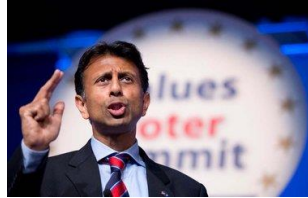
Bobby Jindal spends $73,000 in taxpayer funds on state police protection in Europe

"We believe Louisiana is the only U.S. state to succeed in arranging meetings with all of the top Cuban government ministries for which we requested an audience," Pierson said.