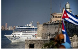
Why a New Orleans-Cuba cruise could soon become reality (again) A measure allowing Americans to travel freely to Cuba has won U.S. Senate approval.

President-elect Donald Trump threatened during the campaign to revert to more restrictions on travel and trade with Cuba. He said he would undo Obama's warming of the U.S.-Cuba relationship.