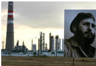
This refinery in Cienfuegos, Cuba, is part of the oil infrastructure Venezuela has assisted in building

As President Obama re-examines the nation's offshore oil drilling options, some observers are hoping one area, currently off limits, proves too tempting to overlook: Cuba.